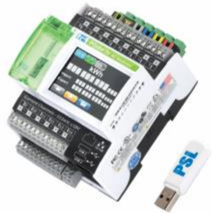
PSL PQube3e Power Analyzer

Montra Hotel Sabro Kro Viborgvej 780 8471 Sabro